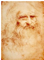
Leonardo da Vinci (1452 - 1519) Self-Portrait

and to the equally great Dante Alighieri ,