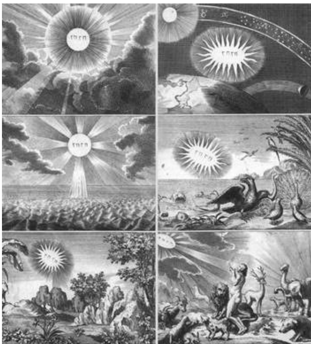
Figure 3. The biblical creation in six days. From the Atlas historique et géographique by Claude Buy de Mornas, Paris, 1761.

To find those similar causes is sufficient, in fact, trying to glance far from our Everyday, of an evolved Western-World citizens, to what could have been one time the relationship of man with nature: with the starry vault, with the