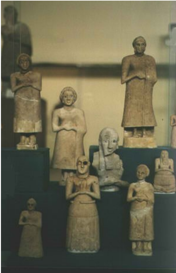
Figure 5. Statues of Sumerian deities. (Archaeological Museum of Iraq, Baghdad)