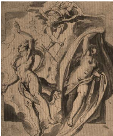
Figure 2. Guido Reni (1575-1642): the separation of the day from the night. (Paris, Louvre)

especially of the most ancient ones, the "Theogony" (the story of the birth of the gods), is often preceded by "Cosmogony" (the story of the birth of the Whole), and the same deities are imagined to be generated by a primordial element, by a "Creating Principle", be it the Desire, the Tree of Life, the Cosmic Egg, the Water, the Emptiness, the Chaos, the Wind.