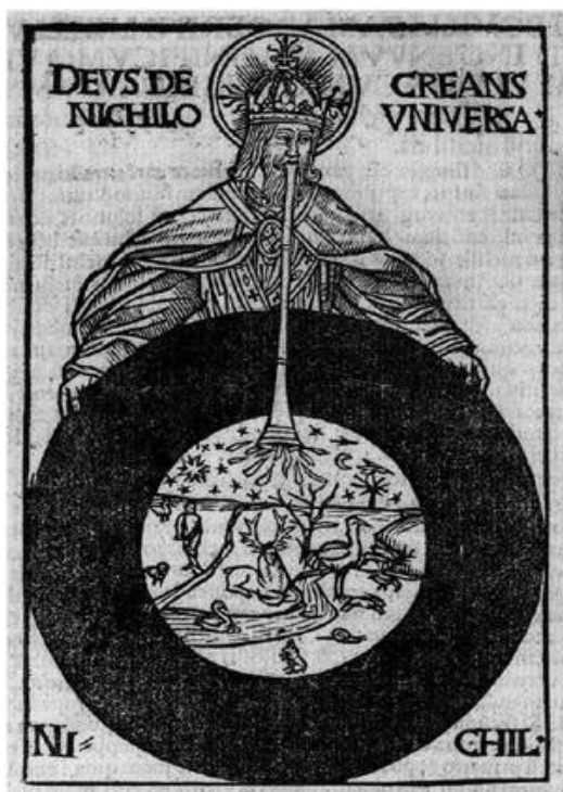
Figure 4. The creation of the world out of nothing by divine breath. From the Liber de nichilo (Amiens, 1510) of Charles de Bouelles neo-Platonist. (Paris, BnF, Réserve des livres rares, 155, Rés., f° 63)

What's deeply and consciously different from searching a motionless and eternal universe in