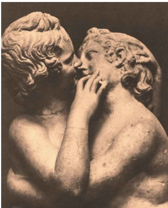
Figure 1. Eros and Psyche: detail of a Roman Sculpture. (Capitoline Museum, Rome IT)

The Greek myth of the origin of the World and gods, that we have very succinctly summed up, as well as many other aspects of Greek Culture, has a deep derivation from the ambit of the Near Middle East. Let's remember, example