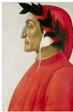
Dante Alighieri (1265 - 1321)

and to the equally great Dante Alighieri ,